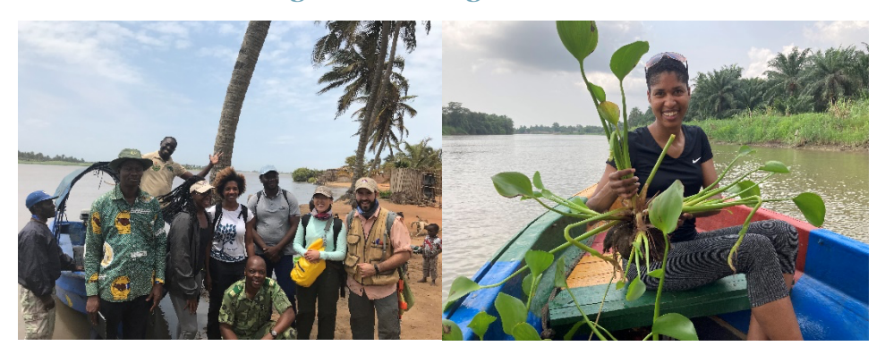
FIGURE 1. THE US-BASED PROJECT TEAM HAS VISITED BENIN TO PERFORM FIELD WORK WITH GREEN KEEPER AFRICA AND THE NATIONAL REMOTE SENSING OFFICE IN BENIN REGULARLY SINCE 2018. DURING THE FIELD VISITS, THE TEAM LEARNS ABOUT THE LOCAL CONTEXT FROM THE BENINESE COLLABORATORS. THEY ALSO COLLECTS DATA USING INTERVIEWS DRONES, MOBILE PHONES AND WATER SENSORS TO IMPROVE THE INTERPRETATION OF SATELLITE DATA.

Local companies and scientists in Benin are increasing their use of earth science information to manage forests and water resources. The invasive water hyacinth plant grows aggressively in Benin and many countries in Africa, harming local activities in fishing, transportation and trade. The Beninese company Green Keeper Africa creates a business that brings jobs and environmental restoration by harvesting the water hyacinth and converting it into a product that can absorb oil-based pollution. Meanwhile scientists at the national remote sensing office are using satellite data to map mangroves and government-managed forests while reducing risks for illegal deforestation and fires.