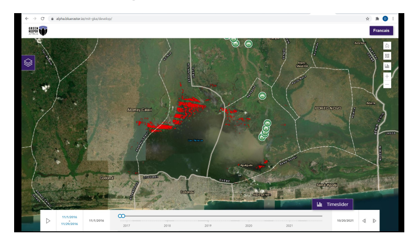
FIGURE 2. THE PROJECT CREATES A NEW ONLINE OBSERVATORY THAT WILL BE USED BY GREEN KEEPER AFRICA TO HOST OBSERVATIONS OF WATER HYACINTH IN SOUTHERN BENIN. THE OBSERVATORY IS DESIGNED BY THE BLUE RASTER COMPANY WITH GUIDANCE FROM THE MIT TEAM TO SHOW INFORMATION FROM SATLELITES, DROWN AND IN-SITU WATER SENSORS THAT INFORM THE MANAGEMENT OF WATER HYACINTH.

visits of government-managed forests to learn how CENATEL already uses satellite-based earth observation data and positioning services to perform surveys and apply for management policies. Researcher Abigail Barenblitt of NASA GSFC provided CENATL with training on how to use Google Earth Engine for cloud-based analysis of satellite data. Through the project, the CENATEL teams aims to compare their standard methods for performing forest inventory with field surveys with recently available methods that apply high resolution data to train machine learning algorithms and improve the classification using medium resolution data.