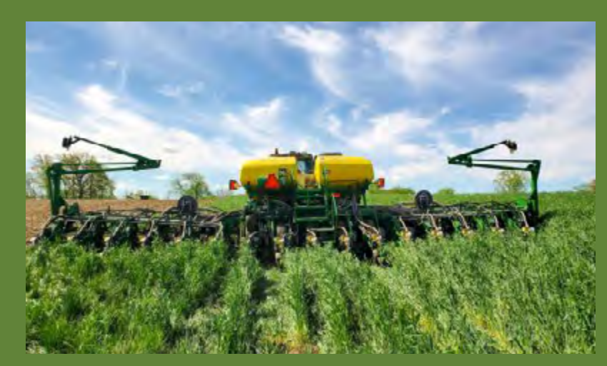
Shoring up the Corn Belt's Soil Health with NASA Data How 'cover crops' help preserve soil health across America's Corn Belt. +VIDEO

NASA data and computer models provide details on soil quality and conservation, fertilizer use and run-off, and how the agriculture industry interacts with carbon storage projects.