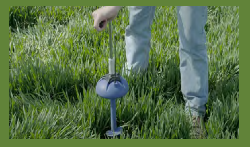
NASA Harvest and CropX Partner to Support Sustainable Agriculture

NASA joins USDA, the Forest Service, NOAA and other federal agencies in providing data and expertise to creating a coordinated and focused scientific strategy for carbon cycle research. +WEBSITE