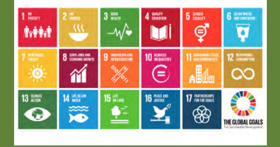
Sustainable Development Goals: Enabling Communities to Become more Sustainable

One of NASA's newest missions, OCO-2 provides a global overview of carbon dioxide in the atmosphere. <u>+ARTICLE</u>