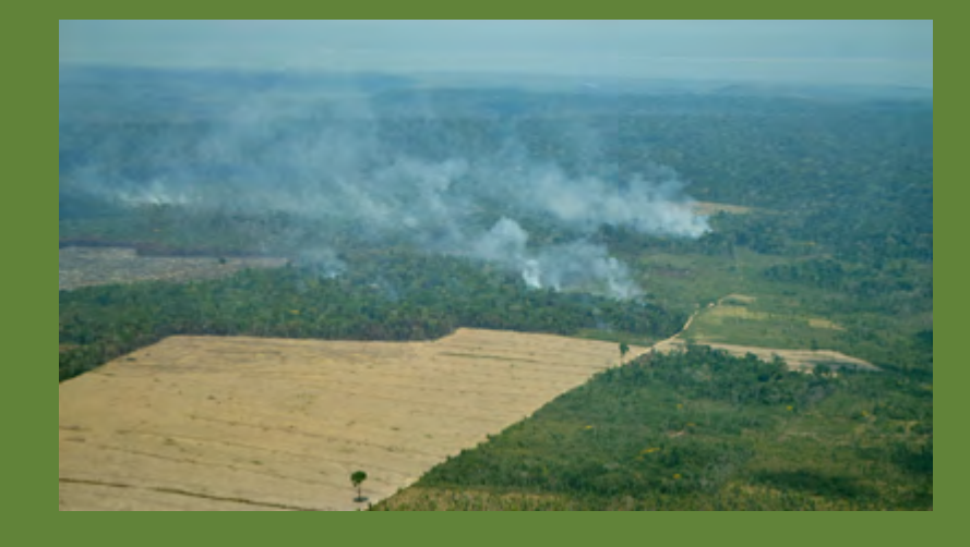
Tracking Amazon Deforestation

The NASA/USGS Landsat satellite mission is helping scientists study how the Amazon rainforest has changed over decades. The Amazon is the largest tropical rainforest in the world, but every year, less of that forest is still standing. +VIDEO