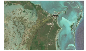
SENTINEL 2 TRUE COLOR RGB