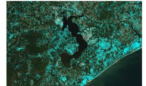
JPL ARIA FLOOD PROXY MAP