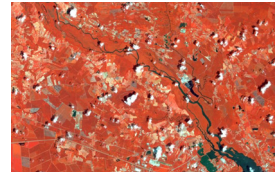
LANDSAT 9 FALSE COLOR RGB