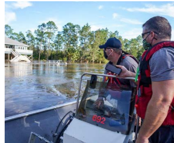
FEMA responders surveying flooded areas.

A collection of datasets, models and tools and other resources that can aid your community is available at: appliedsciences.nasa.gov/what-we-do/disasters/practitioner-resources .