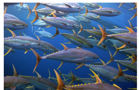
FIGURE 1. MAKO SHARK.