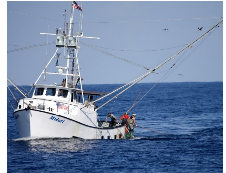
FIGURE 3. TROLLING VESSEL.

The projection aspect of the toolkit is especially relevant to SDGs because it illustrates the longevity and adaptability of fisheries. These future models and recommendations highlight a viable path to sustainable fishery management, which is a crucial component of SDG 14. FaCeT is still in the development stage, but several key species and fishing fleets of interest have been identified for the tool to focus on. Swordfish, mako (Figure 1) and blue sharks, as well as yellowfin (Figure 1), bigeye, and skipjack tuna are the migratory species currently being looked at across the US. Additionally, models analyzing longline fleets as well as trolling fleets (Figure 3) have been integrated into the toolkit. Although FaCeT is not being used to report on SDGs, its applications to the future of fishery management are highly important and related to sustainability.