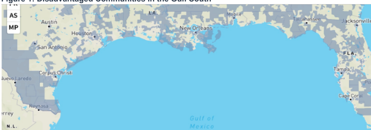
Figure 1: Disadvantaged Communities in the Gulf South

An article by Emily Pontecorvo in GRIST (<a href="https://grist.org/equity/the-little-known-open-source-community-behind-the-governments-new-environmental-justice-tool/">https://grist.org/equity/the-little-known-open-source-community-behind-the-governments-new-environmental-justice-tool/</a>) describes the development of CEJST as a pioneering experiment in open governance, with its software development being entirely open source. Led by the U.S. Digital Service (USDS) and the Council on Environmental Quality, the open-source science approach allowed anyone to access the code on GitHub, contribute to its development, and understand its functionality. A public Google Group, monthly community chats, and regular office hours via Zoom supported the engagement of the development community. This project was designed to be open, transparent, inclusive, and aligned with EJ principles.