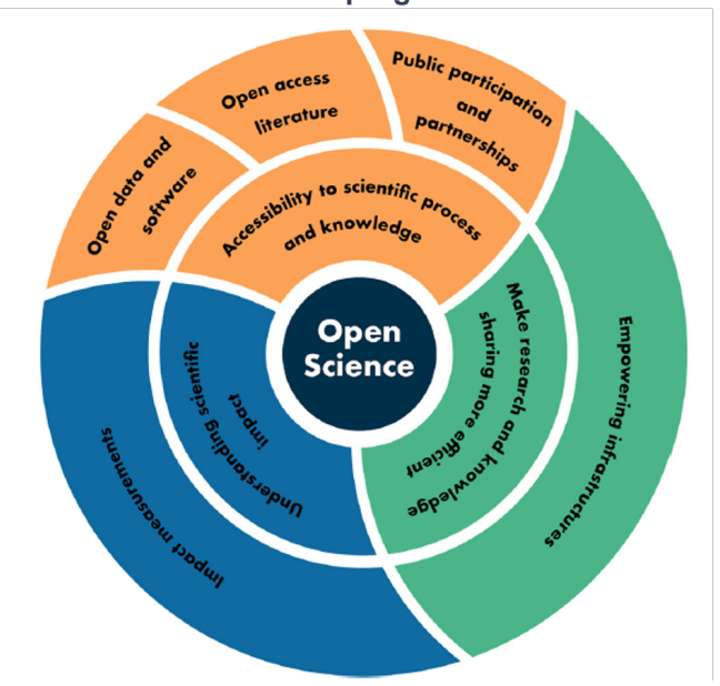
Figure 2: Three (3) key domains of Open-Source Science and their program elements

The NASA-engaged Earth Science community has less experience in program strategies to enable empowering infrastructure and strengthen impact measurement than other Open-Source Science program elements. Empowering infrastructure is envisioned as both the cyberinfrastructure and