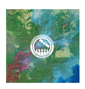
Investigating Time Series of Satellite Imagery

This training will focus on two tools, AppEEARS from the LPDAAC, and LandTrendr via Google Earth Engine (GEE). AppEEARS enables users to integrate point or polygon ground-based data with satellite imagery. The GEE implementation of LandTrendr enables users to analyze land cover dynamics, including short-term disturbances and long-term trends.