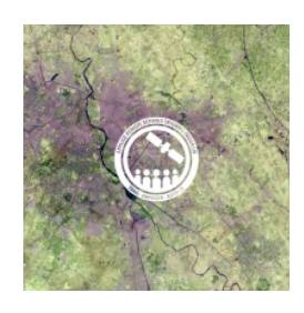
Remote Sensing for Monitoring Land Degradation and Sustainable Cities SDGs

In this training, attendees will learn to use a freely-available QGIS plugin, Trends. Earth, created by Conservation International (CI), and includes special guest speakers from the United Nations Convention to Combat Desertification (UNCCD) and UN Habitat. Trends. Earth allows users to plot time series of key land change indicators. Attendees will learn to produce maps and figures to support monitoring and reporting on land degradation, improvement, and urbanization for SDG indicators 15.3.1 and 11.3.1.