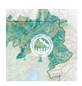
Species Distribution Modeling with Remote Sensing

SDMs contextualize future scenarios based on known or projected ecological parameters and are the cornerstone for adaptive management planning around short- and long-term changes to complex landscapes. This training will provide an overview of SDMs, show how to use remote sensing data for landscape characterization, and highlight multiple Applied Sciences projects that have developed tools for conducting SDM for a variety of ecosystems.