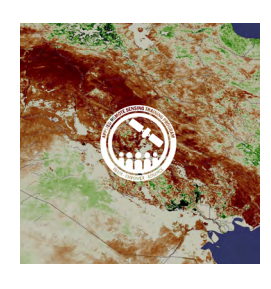
Advanced - 2017

Prolonged drought can result in economic, environmental, and health-related impacts. In this webinar, participants learn how to monitor drought conditions and assess impacts on the ecosystem using precipitation, soil moisture, and vegetation data. The training provides an overview of drought classification, as well as an introduction to webbased tools for drought monitoring and visualization.