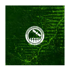
Intermediate - 2017

In this webinar, participants learn how to access and apply satellite data relevant to land indicators, such as estimating total forest area and forest change. The webinar includes an overview of the SDGs, as well as an introduction to image classification and change detection.