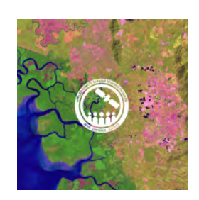
Remote Sensing for Conservation and Biodiversity

Conservation and biodiversity management play important roles in maintaining healthy ecosystems. Earth observations can help with these efforts. This online webinar series introduces participants to the use of satellite data for conservation and biodiversity applications. The series will highlight specific projects that have successfully used satellite data.