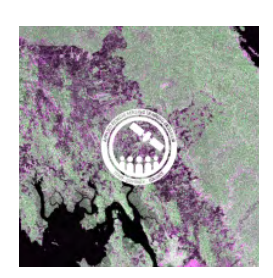
Forest Mapping and Monitoring with SAR Data

This advanced webinar series will introduce participants to 1.) SAR time series analysis of forest change using Google Earth Engine (GEE), 2.) land cover classification with radar and optical data with GEE, 3.) mapping mangroves with SAR, and 4.) forest stand height estimation with SAR.